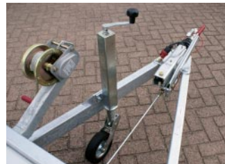
Retractable jockey wheel

At Ansems Trailers we feel very strongly about safety. We want you to be completely safe when you take the trailer out on the road. When we talk about safety we do not mean just the solid construction of the trailer, we are also concerned about your visibility to other road users. The lights, which have been fitted in compliance with EC requirements, have been enhanced with many additional side marker lights. In short, we make sure that you are seen!