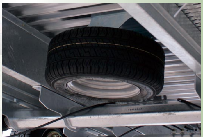
Spare wheel and holder (optional)