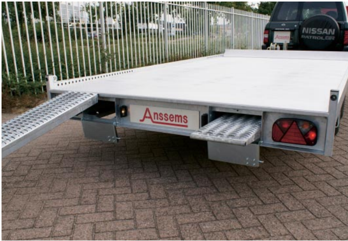
Ramps and rampstorage