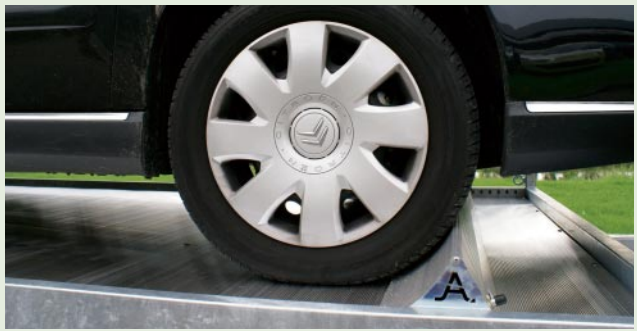
Wheel stop (optional)