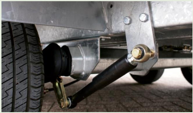
Axle shock absorber (optional)

* Accessory is deliverable at the mentioned trailer. Dimensions mentioned in cm, weights in kg.