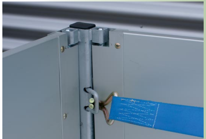
Tie hook (Extension sides)