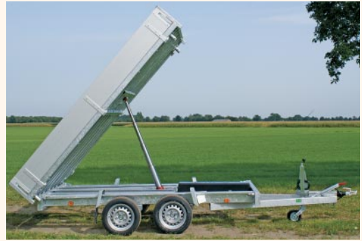
High rear tipping angle