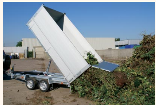
Extension sides (easy unloading)