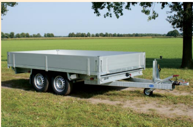
KSX 2000 E