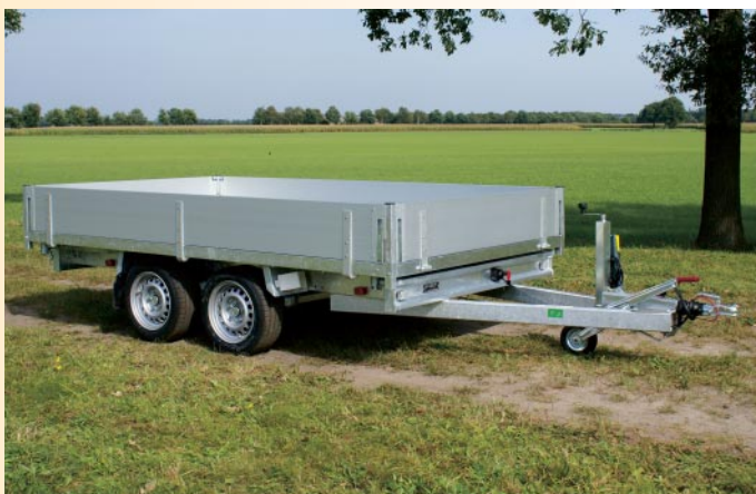
KSX 3000 E