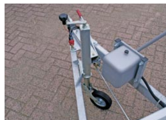
Retractable jockey wheel

All of our tipper trailers are three-way tippers, which means that you can tip the load backwards or to either side. To change the direction in which you tip the load you simply move a pin.