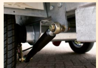
Axle shock absorber (optional)