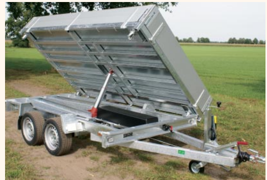
Tipping to the side (standard)