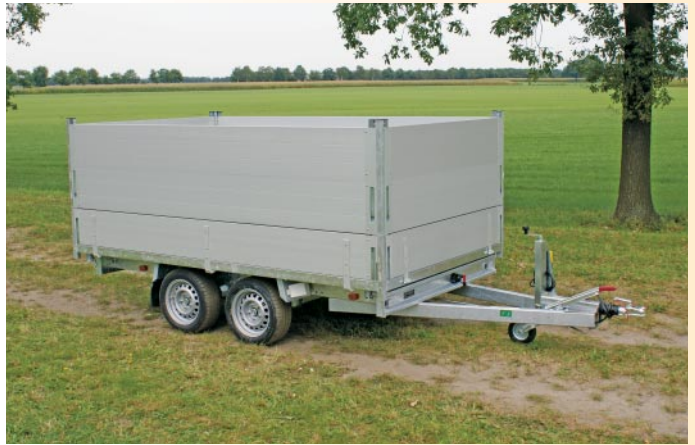
Loading ramps (optional)