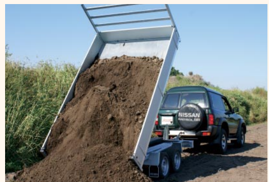
High load capacity