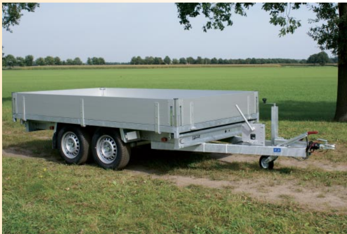
KSX 2000 H

road stability. The axle, overrun brake and coupling we use are of the highest quality. Due to the fact that tipper trailers often have to carry very heavy abrasive loads, ours have a steel floor plate that is 2,5 mm thick. The floor plate is a single piece of steel without any joints and is supported by many main and cross beams of the upper body chassis, which provides a very strong support for the floor plate.